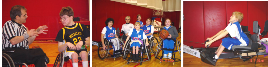
Participants at the South Side Classic

Sponsored by The Claddagh Foundation & Great Lakes Adaptive Sports Association, (GLASA) , this tournament was yet another opportunity to introduce indoor rowing to junior wheelchair athletes. It was also part of our efforts to expand our understanding of current sports programs for those with physical and visual disabilities.