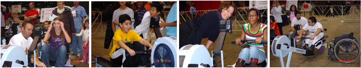
Participants at the Mayor's Holiday Sports Festival

Chicago Indoor Rowing was invited by Chicago 2016 to offer attendees to the annual Sports Festival an opportunity to experience indoor rowing. Although the general public may be perplexed by the notion of indoor rowing, by the end of the 3-day event that started on December 28th, more than 2,520 and perhaps as many as 3,700 youngsters, parents and grandparents had rowed their first 100+ meters with enthusiastic glee. Many came back for more as they challenged their siblings, cousins and friends to beat their score.