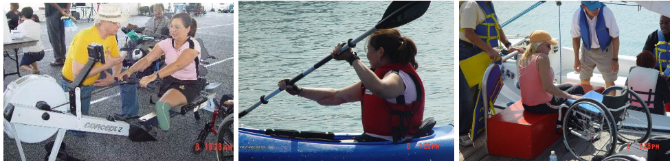
Participants at Veterans Adaptive Activities Day