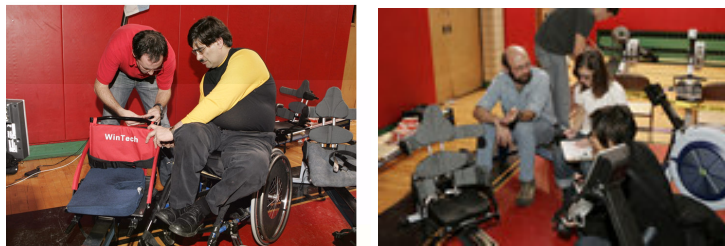
Participants at CIRC 2007

Set against the backdrop of the 9 th Annual Chicago Indoor Rowing Championships , it was our hope that this initiative would provide clarity and insight hence framing future discussions and open avenues for cooperative program development. The event exceeded our conservative expectations. Simply stated, all participants contributed constructive thoughts on program and hardware development that would make indoor and on-water rowing accessible to all.