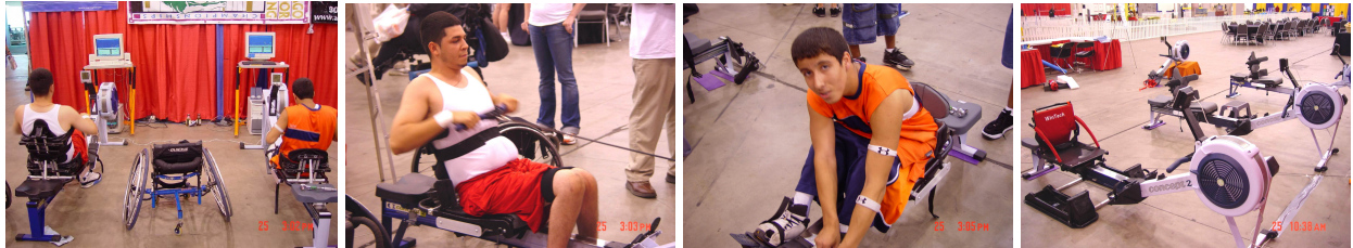
Participants at AccessChicago